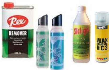
Various types of wax removers

You can buy wax remover which you spray on klister to make it easier to remove.